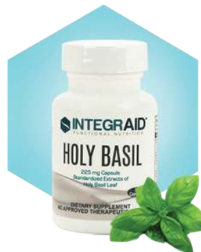
One webinar participant got to take home this bottle of Holy Basil from Integraid.