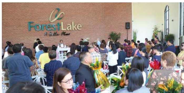
Honored guests, friends and family show support and offered congratulations during Forest Lake Deluxe Chapels Biñan Inauguration and Blessing