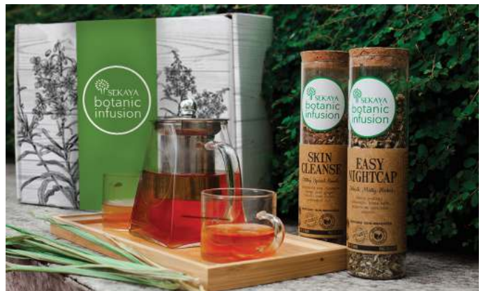
Sekaya Philippines shared this Skin Care Pack as a raffle prize for Creating Better Days

Please visit www.forestlakememorialparks.com to learn more. You can also like and follow Forest Lake on Facebook @ForestLakeMemorialParks and Instagram @forestlakememorialparks.