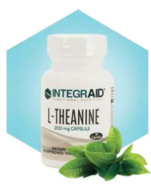
Integraid offered L-THEANINE as one of their raffle prizes for webinar participants.